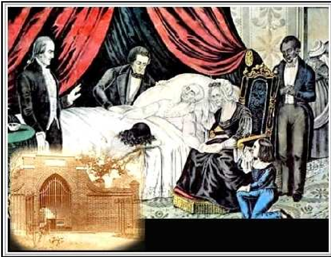
Figure 13.3: The Death of George Washington, 1799, courtesy Currier and Ives. A photograph of Washington's tomb is in the lower left. Washington was very popular and many portraits were made that idealized his deathbed experience. Below is a poem written in his honor to characterize his passing.

Americans behold & shed a grateful Tear For a man who has gained your freedom most dear And now is departing unto the realms above Where he may ever rest in lasting peace & love.