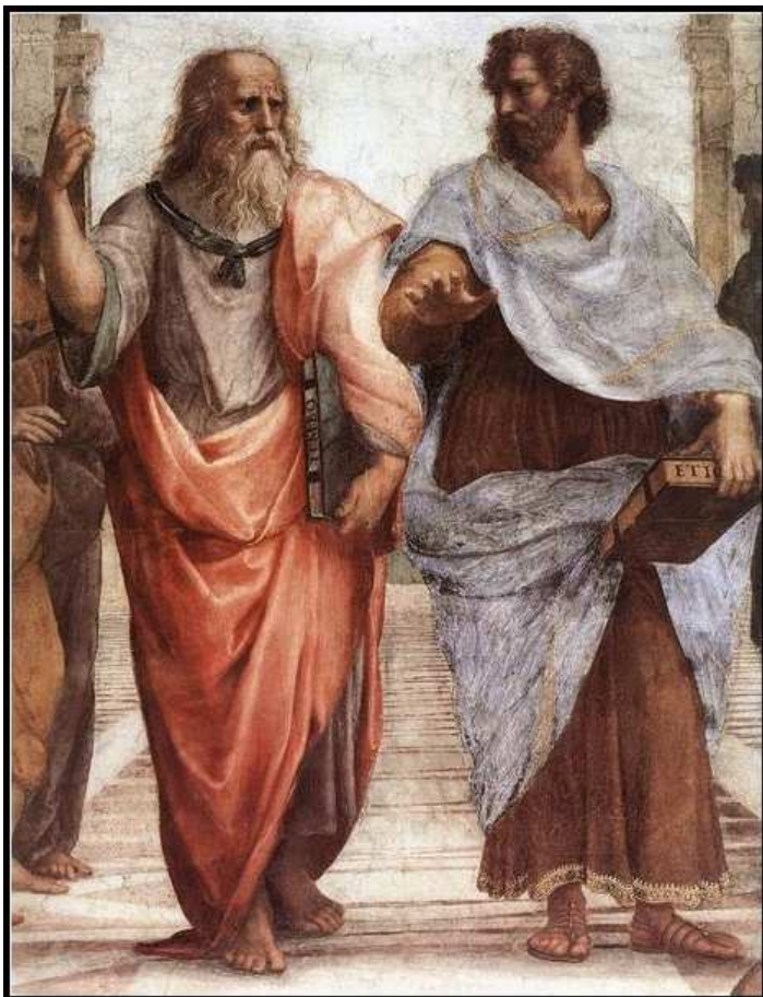
Figure 13.1: In the center of the painting, "School of Athens" are Aristotle and Plato. We find Aristotle's hand level to the Earth, symbolizing his realistic view of Nature. However, Plato's hand is pointed upwards towards heaven, symbolizing the mystical nature of his view of the Universe. This image illustrates the sharp difference between metaphysics (religion) and natural philosophy (science) that was to develop over the next two millennium.

By Raffaello Sanzio - "The School of Athens" -- Plato left and Aristotle right (1509 AD)