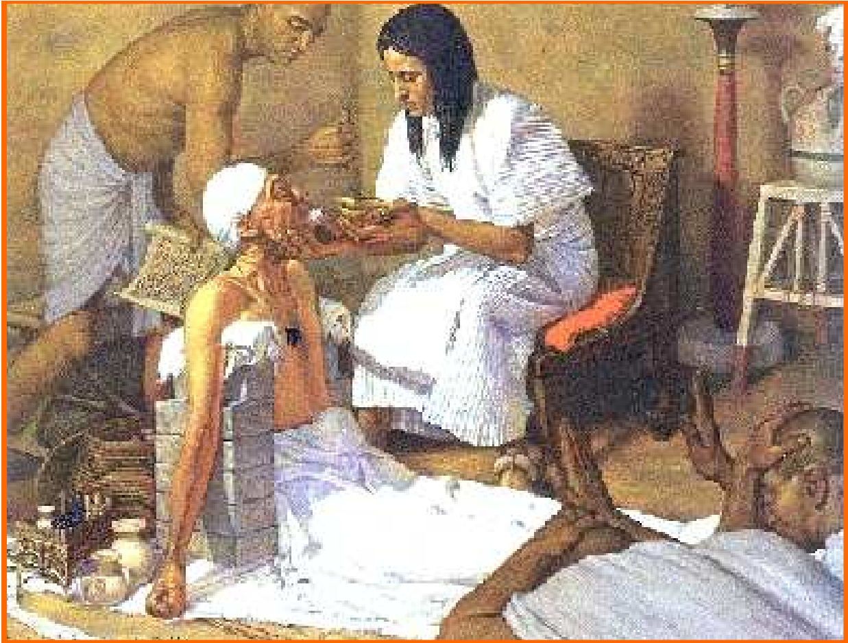
Figure 13.4: The pharmacies of ancient Egypt provided prescriptions using "lizards' blood, putrid meat, stinking fat, moisture from pigs' ears, excretion from humans, donkeys, antelopes, dogs, cats, and flies." This list is quoted from pages of the Papyrus Ebers manuscript as translated in S.E. Massengill's A Sketch of Medicine and Pharmacy .